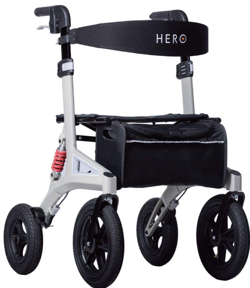
S343145 - Seat Walker - Outdoor Lite All-Terrain Aluminium Grey with Suspension & Wide Track Jumbo Wheels Hero Medical 136kg SWL